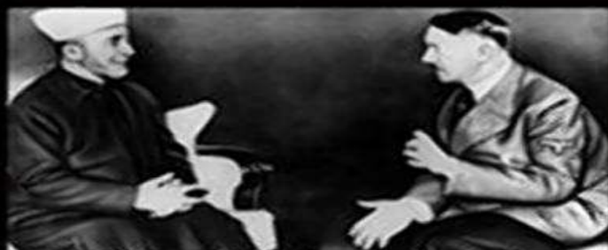
Adolf Hitler and his staunch ally, the leader of the Muslim world, Haj Amin al-Husseini